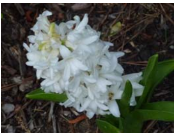
Spring is nature's way of saying "Let's party!" ~ Robin Williams

As always continuing education for our professionals is high on our list and we will continue to offer study groups to aid those of us who will be testing for a FPC or CCP certification this year.